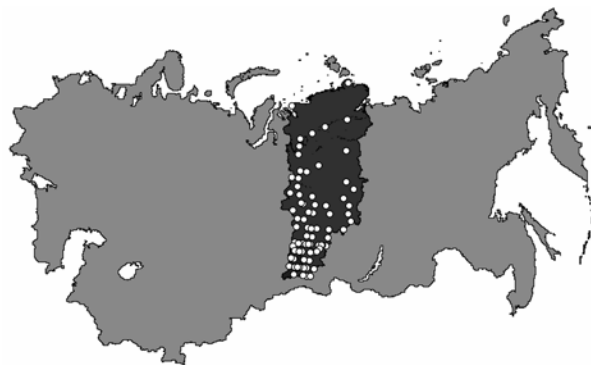
Figure 1. Study area in central Siberia (black) with locations of 80 weather stations used in the study on the background of the former Soviet Union.

Área de estudio en Siberia central (negro) con la ubicación de 80 estaciones climáticas sobre el mapa de la anterior Unión Soviética.