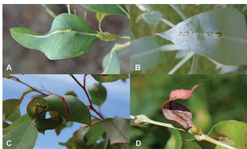
Figure 3. A) Shape and typical position of galls of Leptocybe invasa in Eucalyptus tereticornis x E. camaldulensis . B) Oviposition marks in E. globulus . C) Anomalous development on young plant in E. grandis . D) Necrosis and death of leaves and stems as a consequence of the attack by L. invasa in E. globulus .

A) Forma y posición típica de agallas de L. invasa en E. tereticornis x E. camaldulensis . B) Marcas de oviposición en E. globulus . C) Desarrollo anómalo en plantas jóvenes de E. grandis . D) Necrosis y muerte de hojas y ramas a consecuencia del ataque de L. invasa en E. globulus .