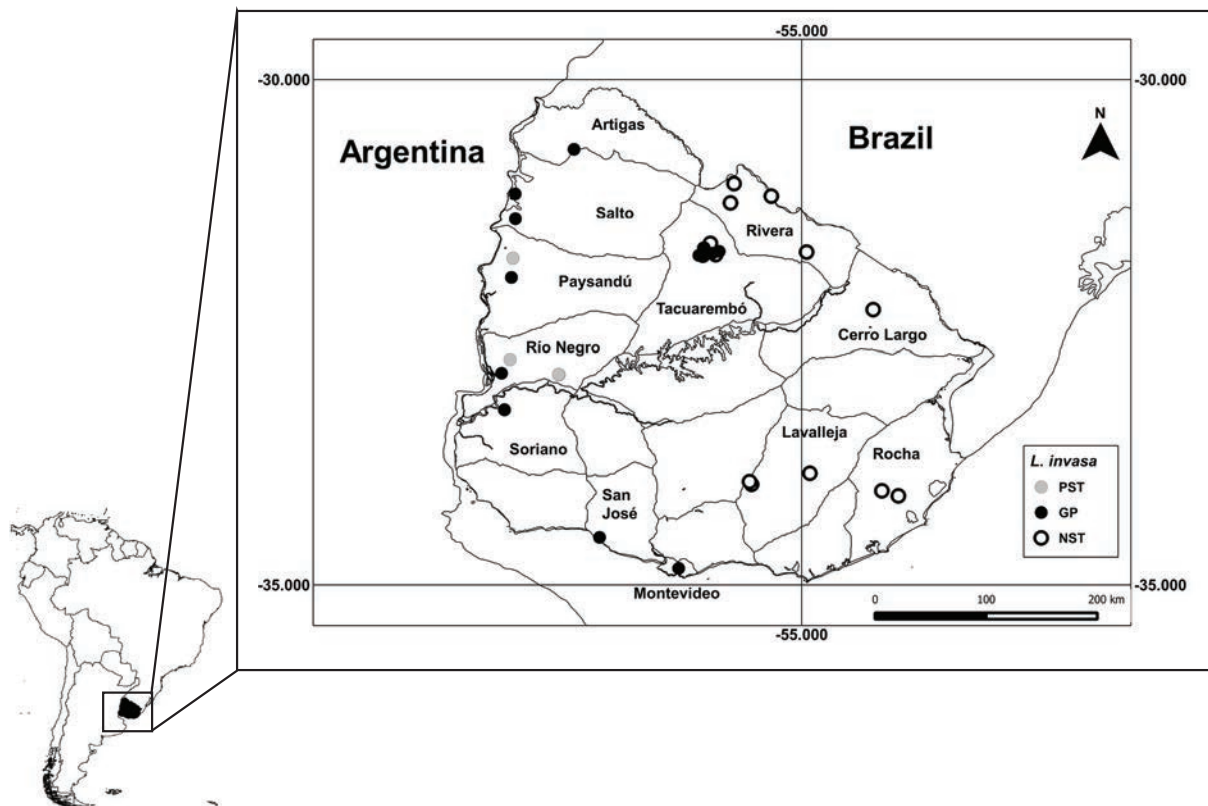
Figure 1. Occurrence of L. invasa in Uruguay. On yellow sticky cards: grey dots = presence; white dots = absence; black dots = presence of galls on survey points.

Leptocybe invasa is a small wasp (1.1-1.4 mm) brownish in color with blue green metallic shine on the thorax (figure 2A). Specimens were ascribed to L. invasa based on the antennal morphology, thoracic morphology and wing venation (figure 2B-D). Detailed diagnosis of adult female was provided by Mendel et al. (2004). Scape longer than the pedicellum with broadened middle section. Flagellum with six segments separated by four annelli , the basal segments constitute the funiculum and the three apical segments form the antennal mass (figure 2B). Short prothorax; well-developed mesothorax; scutellum divided into three